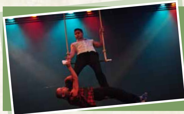
The Palestinian Circus School

Lighting design is an exciting combination of artistry, creativity and technical expertise; designers often work with theaters, music concerts, circus, dance performances and in film.